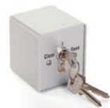
RRTKEY Key Switch