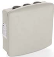
RCU1-KIT Control Unit (Radio)