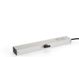
MICRO EVO Chain Actuator