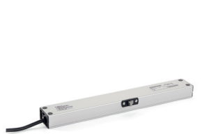
MICRO S Chain Actuator