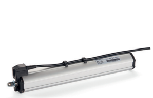
D8 FCE Spindle Actuator

(Multiple 230V AC actuators, total load must not exceed 3.15 A max.)