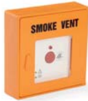
SCU-CP Override Switch