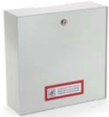
SCU-4 AOV Control Unit