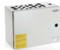
WSC 310 AOV Control Unit