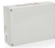
PSU-2/4/8 24V DC Transformer